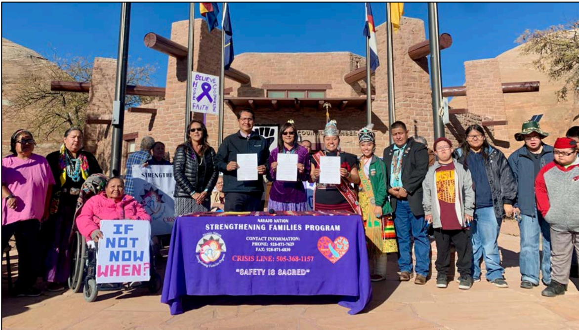
PHOTO: President Jonathan Nez, 24 th Navajo Nation Council members, and domestic violence prevention advocates at the signing of the Navajo Nation Domestic Violence Awareness Month proclamation at the Council Chamber in Window Rock, Ariz. on Oct. 21, 2019.

WINDOW ROCK — Navajo Nation President Jonathan Nez and members of the 24 th Navajo Nation Council joined together on Monday, to recognize the month of October as “Navajo Nation Domestic Violence Awareness Month” and “Disability and Autism Awareness Month” prior to the official start of the 2019 Fall Council Session at the Council Chamber in Window Rock, Ariz.