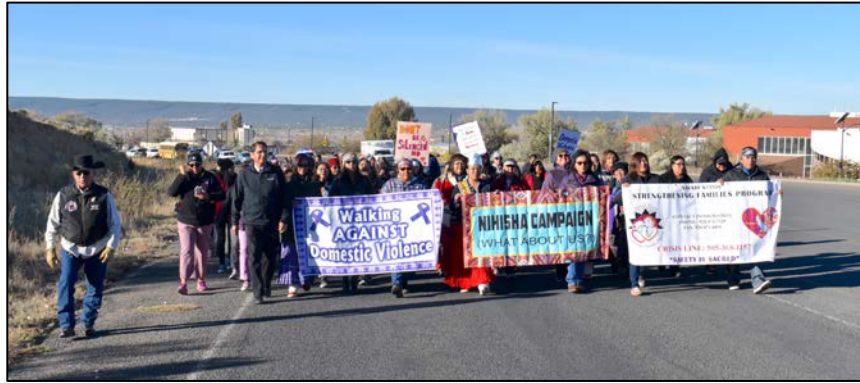
PHOTO: Participants of the walk to raise awareness for domestic violence prevention and disability and autism awareness on Oct. 21, 2019 in Window Rock, Ariz.

The proclamation recognizes that “all families living on the Navajo Nation are entitled to a safe, healthy, stable, and loving environment which nurtures and protects each family member,” and that “domestic violence is a wide-spread serious crime that affects