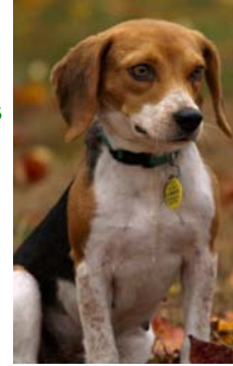
Dog with Animal License

license needs to be placed on the collar of the animal and indicates that the animal is registered to be on the Navajo Nation. The animal license is also the rabies vaccination tag for the animal. All dogs and cats three (3) months and older are vaccinated for rabies each year. The Navajo Nation animal license is good for the calendar year. The animal license will expire December 31st. It is the responsibility of the pet owner to purchase an animal license each year for each individual pet.