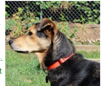
Dog confined in a fenced yard

All pet owners are required to keep their animals confined and restrained at home at all times. This may require some type of containment. Whether the pet owner chooses to contain their pet in a fenced yard, run line or chained, all pets require proper care while under the restraint of their owner. Good food, water, shelter and exercise for each pet is needed for pets to live a healthy life.