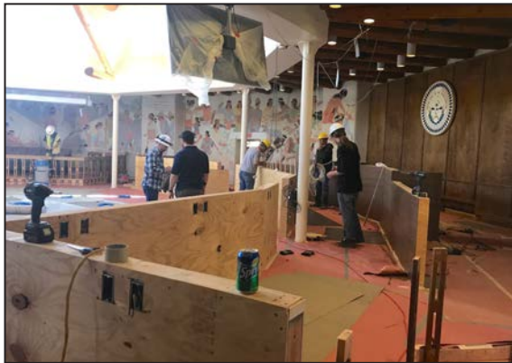
Photo: A quick look at workers from Keyah Construction, Inc. doing renovation work inside the Council Chamber.

The Navajo Nation Historic Preservation Department has been actively involved to ensure the property maintains the highest degree of integrity to meet the criteria established through the National Historic Landmark requirements.