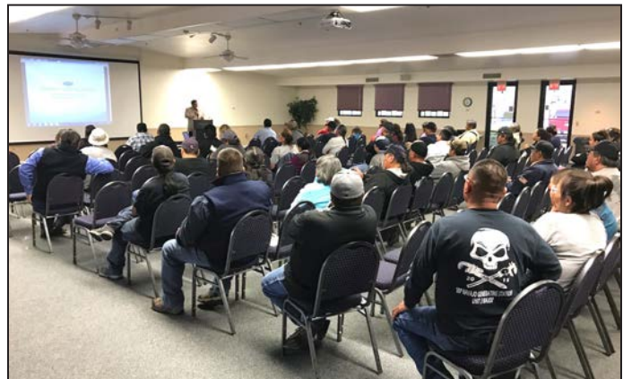
Photo: NGS employees were provided a presentation session by the Office of the Speaker to update workers regarding NGS’s lease with the Navajo Nation on April 5, 2017.