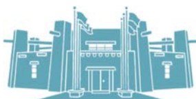
LoRenzo Bates, Speaker 23 rd Navajo Nation Council